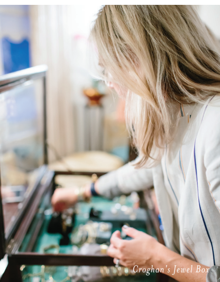
Croghan's Jewel Box

At the very heart of Charleston is a genteel community known for its warm hospitality. A friendly nod and a sincere 'welcome' await.