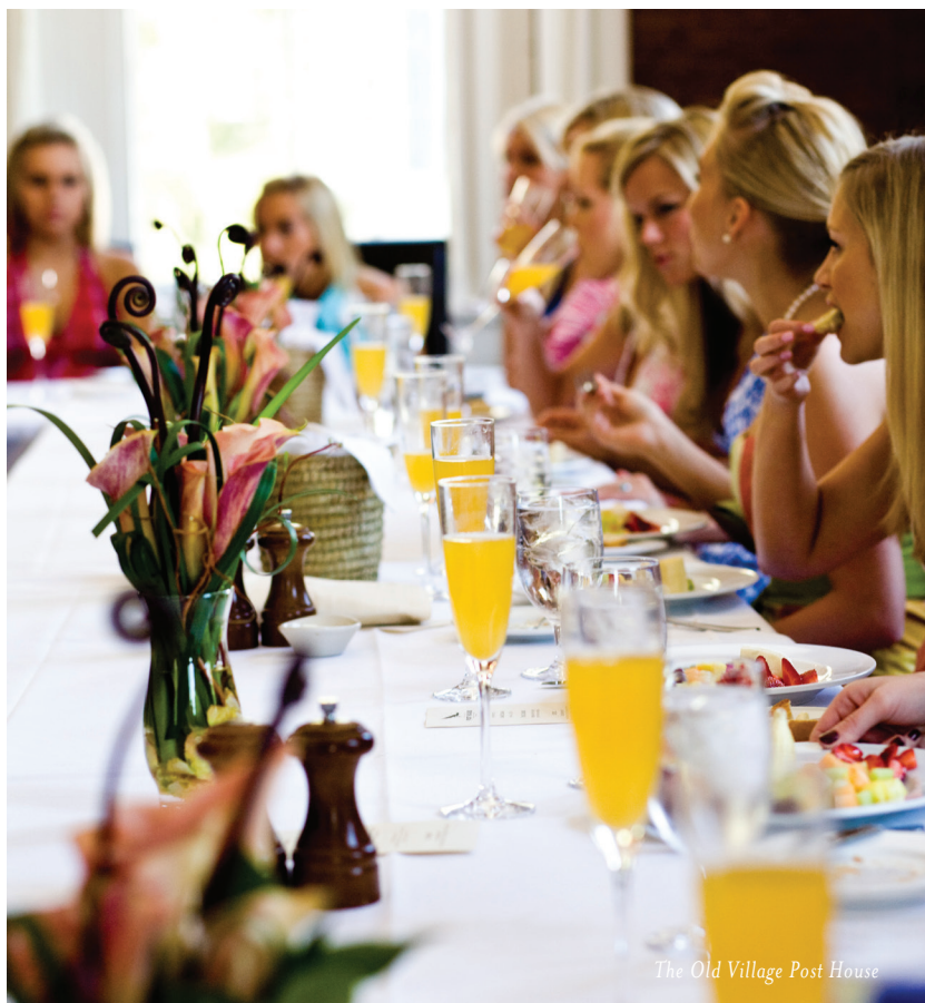
The Old Village Post House

CHARLESTON has fixed coordinates. You may locate it on a map, where it has appeared for the past 343 years. Yet, this beguiling place truly exists somewhere else entirely—it abides in the hearts and minds of those who have strolled the tree-lined streets of this jewel box city.