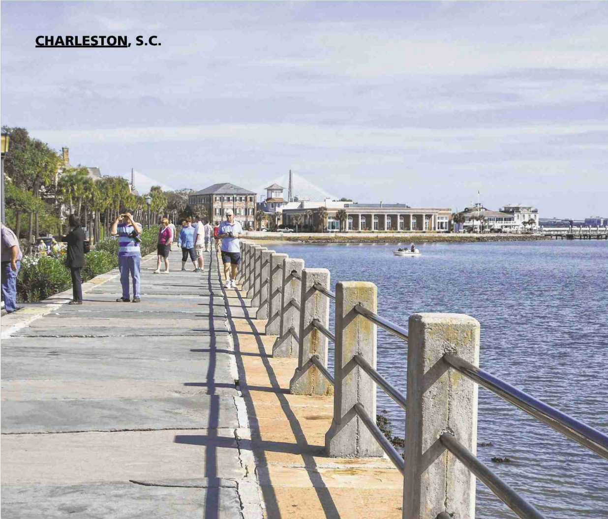
Visitors stroll on the promenade along the Battery, which offers views of Charleston Harbor on one side and, on the other side, a line of stately antebellum homes in Charleston, S.C.